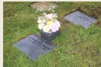
Cremation Tablets in a Churchyard

If the ashes are going to be interred in a local cemetery or churchyard, we would normally recommend that the ashes are contained in a wooden urn.